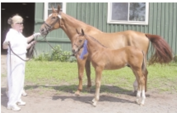
The Hanoverian cross colt by Regaliz, Orlando, poses with his winning ribbons!