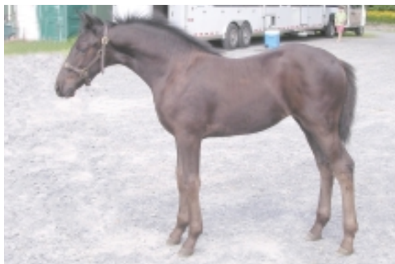
The Friesian cross filly by Regaliz, Sarika, strikes a pose outside the show ring.